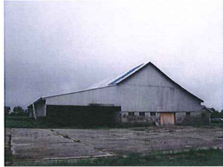
1 Main barn consists of CMU foundation, wood framing/metal siding, metal roof over wood shingle. It is in poor condition with water and structural damage.