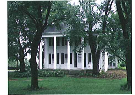
4 Structure consists of wood framing, painted brick, painted wood siding, metal roof. It is in good condition.