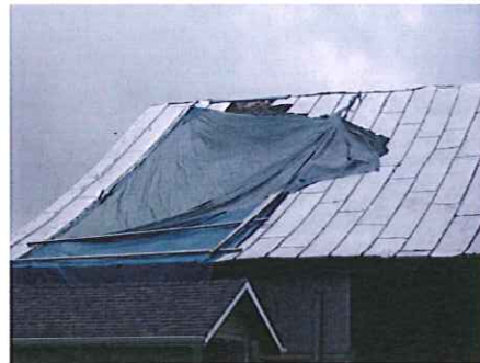
2 Deteriorating roof on main barn. Assume wind damage to metal roof.