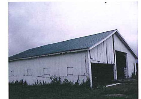
5 Secondary barn consists of CMU foundation, wood framing/siding with metal roof. It is in poor condition with water damage.