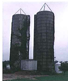
3 Structure consists of reinforced concrete. It is in fair condition. Will acquire additional structural study.